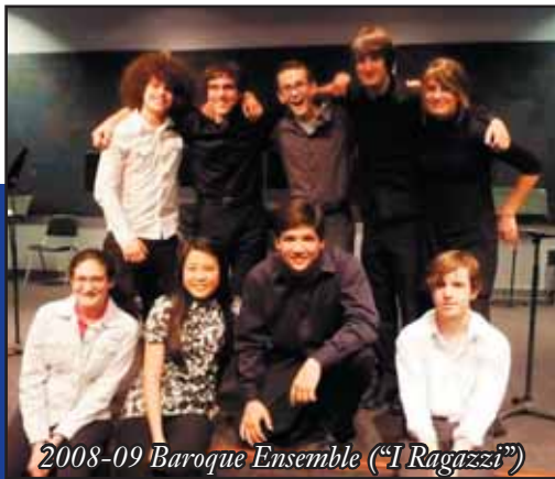
2008-09 Baroque Ensemble ("I Ragazzi")